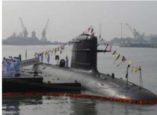
Naval Group has invested over ₹100 crore for three workshops for maintenance of systems of Scorpene submarines.

"The details of technical features and other parameters, including delivery lead time, will be complied