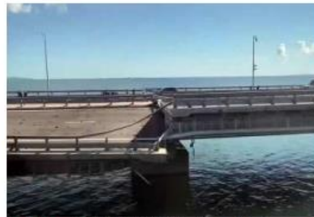
Double impact: The Kerch bridge linking Crimea to Russia was heavily damaged following an attack on Monday.

came hours after drones struck the sole road link connecting Russia to the annexed Crimea peninsula, a key supply line for Russian forces resupplying frontlines in the south of Ukraine.