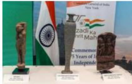
Back to origin: Some of the antiquities handed over by the U.S. to India. SPECIAL ARRANGEMENT

Such an understanding would add further value to the dynamic bilateral collaboration between Homeland Security and law enforcement agencies of the two countries, Ambassador of India to the United States Taranjit Singh Sandhu said, adding "For the people of India, these were not just pieces of art but